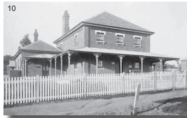
Cowra Court House