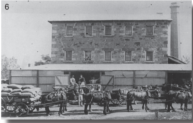
Old Stone Flour Mill