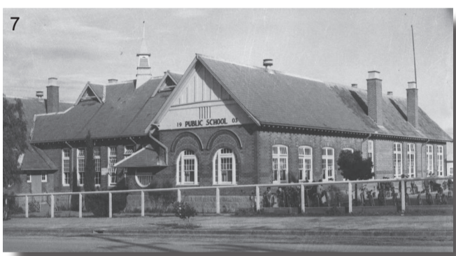
Cowra Public School